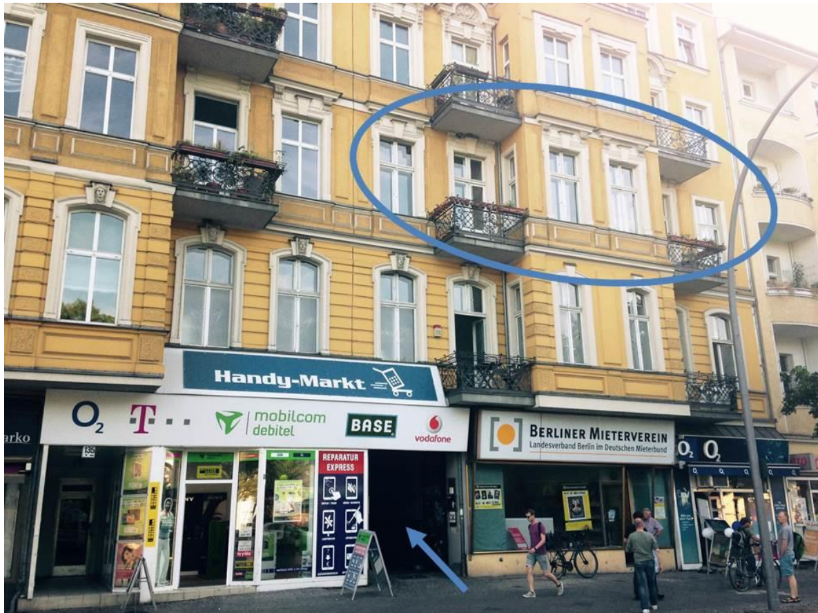
Picture of the entrance

You enter just left of “Berliner Mieterverein” and then take the door on the right side to the second floor.